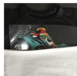
8. Cover a cotton fabric