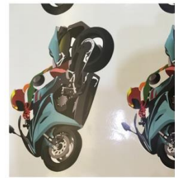
4. peel off the edge