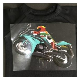
7. Image line facing upwards