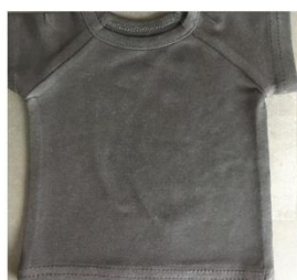
6. Briefly heat the fabric for 5 second