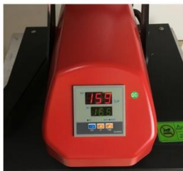
9. Press at 165~175°C for 25~35 seconds