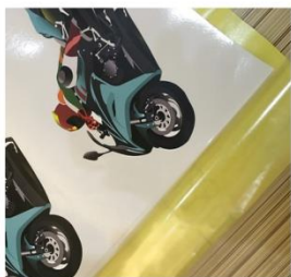
5. peel off the image