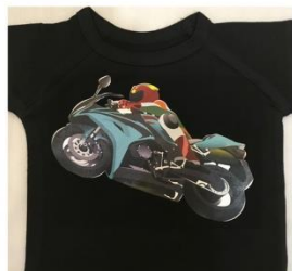
10. Peel adhesive polyester film, Finished!